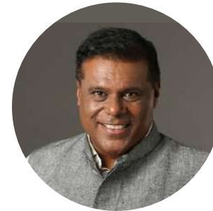
Ashish Vidyarthi National award winning Actor, Speaker, Founder at AVID MINER